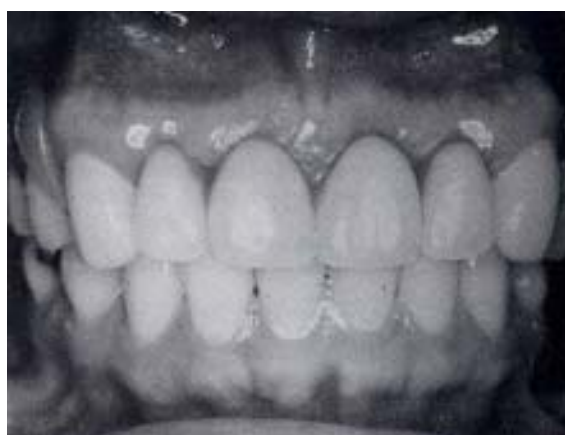
Figure 7. The finished removable partial denture. Fig. 8. Frontal view of a patient wearing the removable partial denture showing excellent esthetics.