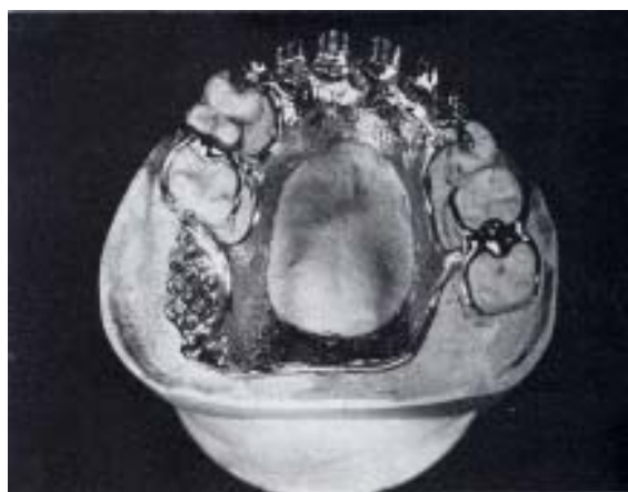
Figure 6. The polished partial denture framework on the master cast showing the slicing of the metal struts that will fit into the lingual surface of the modified anterior teeth.