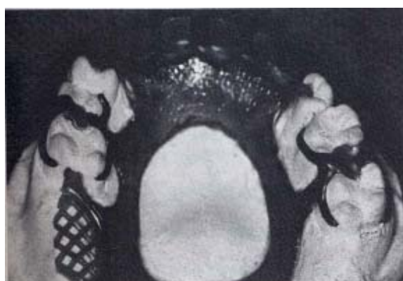
Figure 5. The finished removable partial denture wax up after removal of the plaster index and the modified anterior teeth.