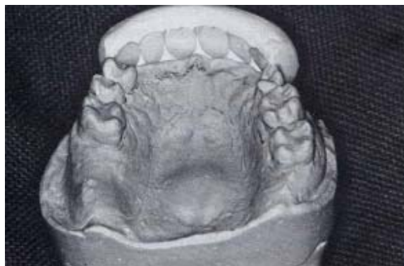
Figure 3. The plaster index is reset while the artificial teeth are in position on the cast.

base. Tooth-coloured acrylic resin of suitable shade is also packed into the lingual surface of the modified anterior teeth. The removable partial denture is processed, finished and polished and then inserted in the patient's mouth [Fig. 8].