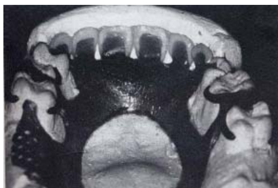
Figure 4. The plaster index and the modified anterior teeth are repositioned and waxing up of the RPD framework is performed.