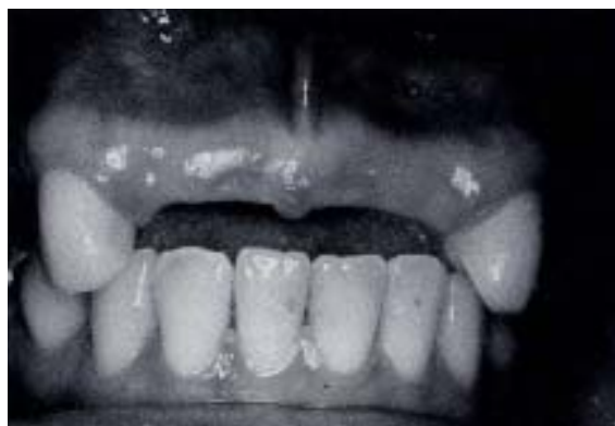
Figure!. Partially edentulous patient with missing anterior teeth.

criteria that were used for patient selection for fixed prosthetic service were equally applied to patient selection for removable partial denture service, the myth of an association of removable partial dentures with a higher incidence of dentogingival disease would be refuted. 2-4 In a biomechanical context, the superiority of one treatment over the other may be questionable. The extensive reduction of tooth structure for fixed prosthodontic abutment preparation coupled with permanent cementation of the prosthesis