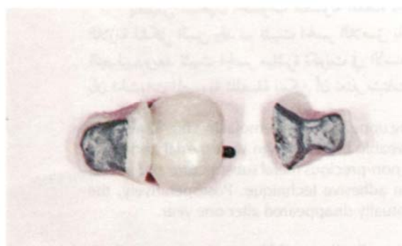
Figure 2. The fitting surfaces of the bridge components showing the metallic sub-structure incorporating the key attachment through the pontic.

consisting a mesial inlay retainer on tooth # 14 which carried the female part of the movable joint. The pontic, on the other hand, carried the male part with the distal inlay retainer on tooth # 16 as shown in Figures 1 and 2. The bridge was cemented with Porcelite® dual cure (untinted) cement [Fig. 3]. This cementation followed the preparation of the fitting surfaces of the bridge by etching with acid and silane from the Mirage FLC ® kit before applying the Porcelite luting cement. Two weeks later, the recall visit consisted of checking the occlusion, eliminating the high spots, and polishing the restorations. There was post-restoration sensitivity after a one-month recall. At six-month-recall, the restorations were still intact and all teeth were in good health. By the twelfth month the sensitivity had completely disappeared.