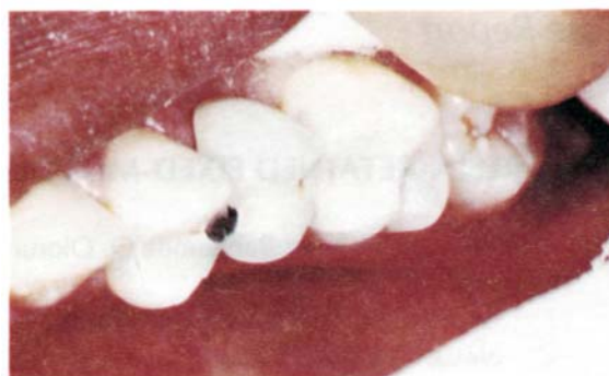
Figure 3. Intraoral view of the bridge immediately after cementation.

© Kerr Manufacturing, USA. Chameleon Dental Products, USA.